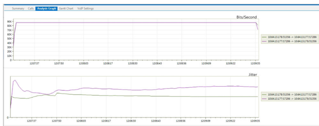
From aggregate-level VoIP summaries...