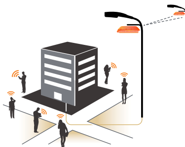
Rapid deployment: Smart Mesh